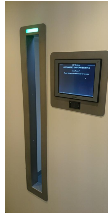
Automatic issue point uniforms are stored securely inside