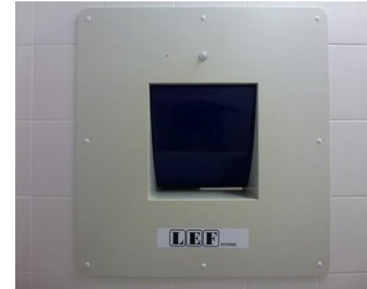
Soiled items are returned through RFID chip chute